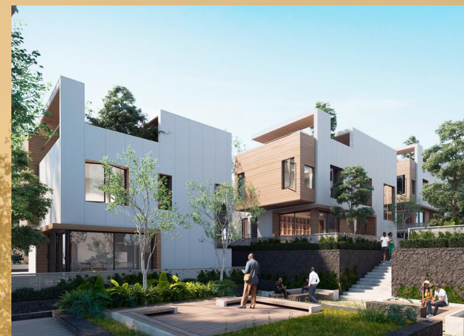
Contemporary Villas 3-4 bedrooms