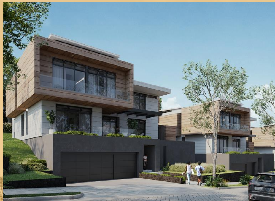
Luxury Villas 5 bedrooms