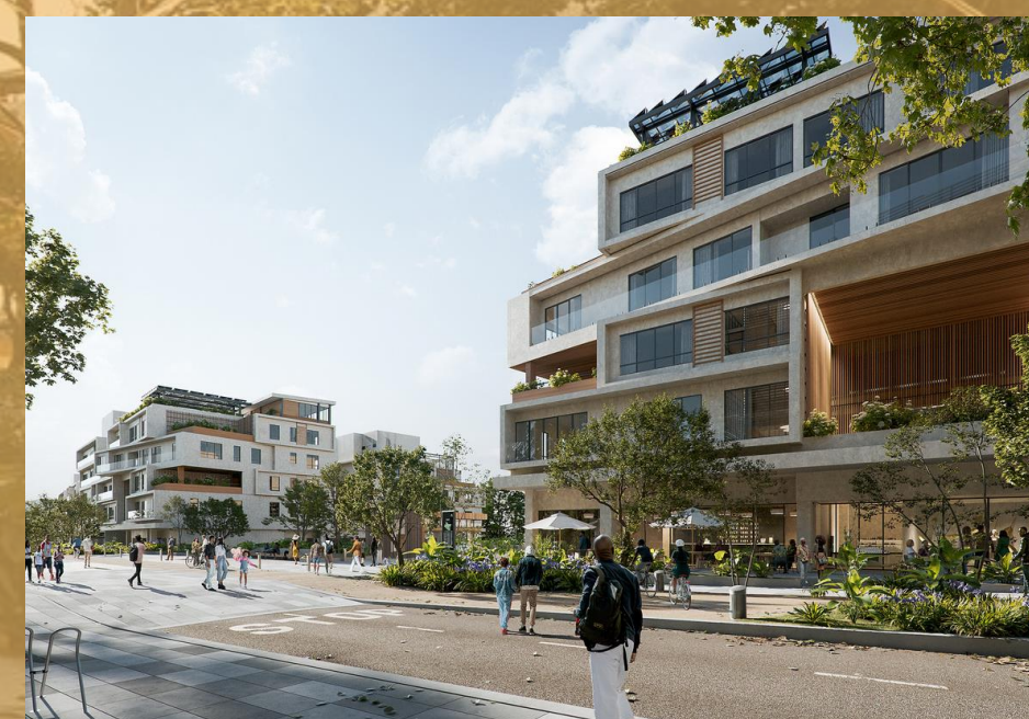
Apartments 1-3 bedrooms