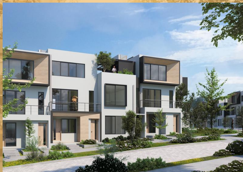
Row Houses 1-2 bedrooms